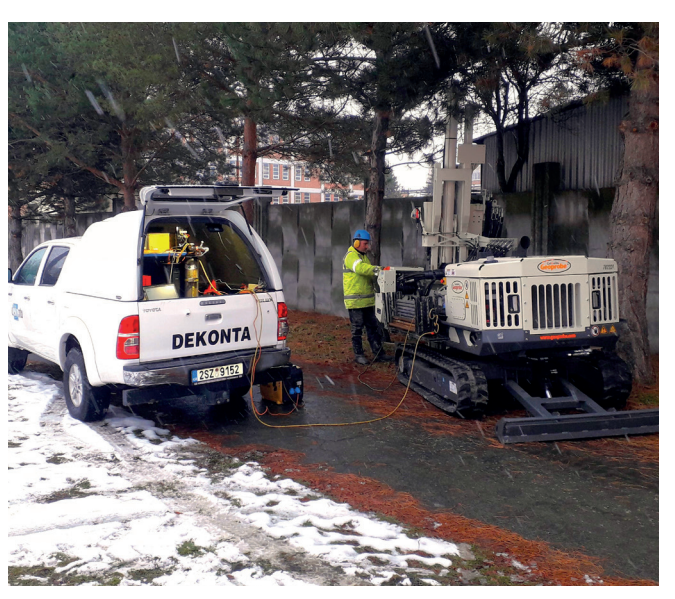
MIHPT logging using Geoprobe 7822DT