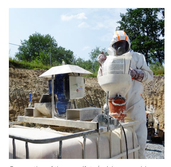
Preparation of the persulfate/calcium peroxide suspension