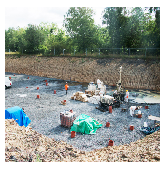
Direct push injection of the persulfate/calcium peroxide mixture

ISCO combining persulfate and calcium peroxide direct push injections utilized to treat the groundwater beneath an old unmanaged landfill contaminated by a mixture of chlorinated hydrocarbons (mainly 1,2-dichloroethane and chloroform) and BTEX (mainly benzene and toluene). First of all, the old landfill was excavated to the groundwater level. 3D model of the contamination beneath the landfill was developed based on a detailed direct sensing investigation using the Membrane Interphase Probe (MIP Geoprobe). Based on the model, targeted direct push injections of persulfate and calcium peroxide mixture were performed. This mixture provided a strong oxidant for ISCO of the present contaminants, and it also released oxygen for further aerobic bioremediation of the solvents in the contamination plume.